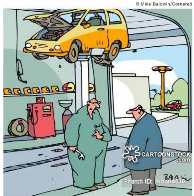
"It's broke. I could fix it, but then you'd be broke."