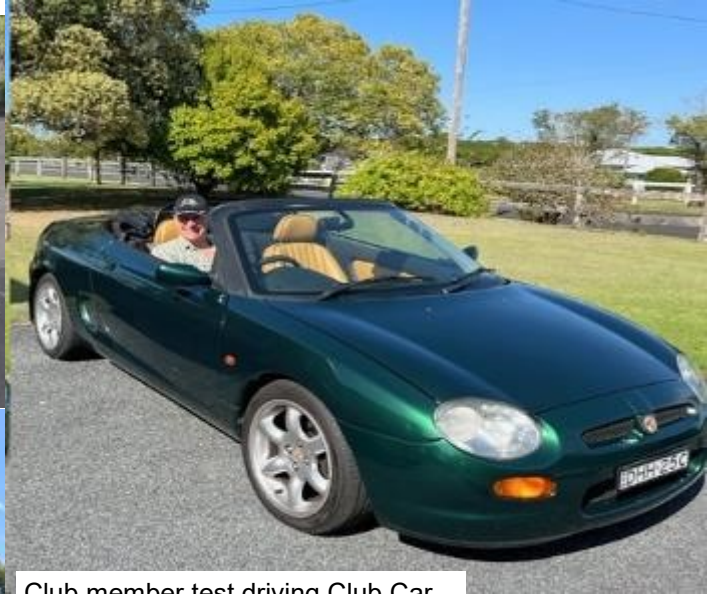
Club member test driving Club Car. Sales pitch maybe not good enough