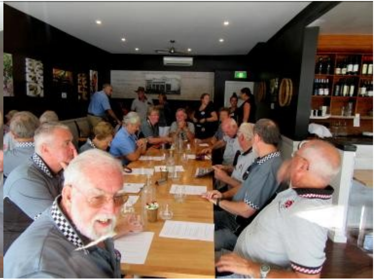
More shots from the Ballina Show n Shine—thanks Ray Collingwood