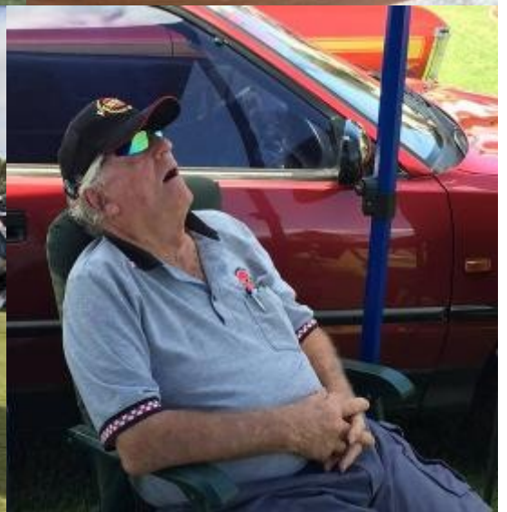
The invisible man asleep on the job at the Ballina Show n Shine