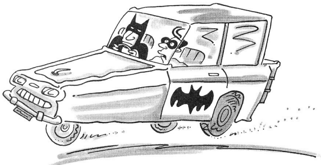
'Holy recession, Batman. It's not the same since we lost our company car'