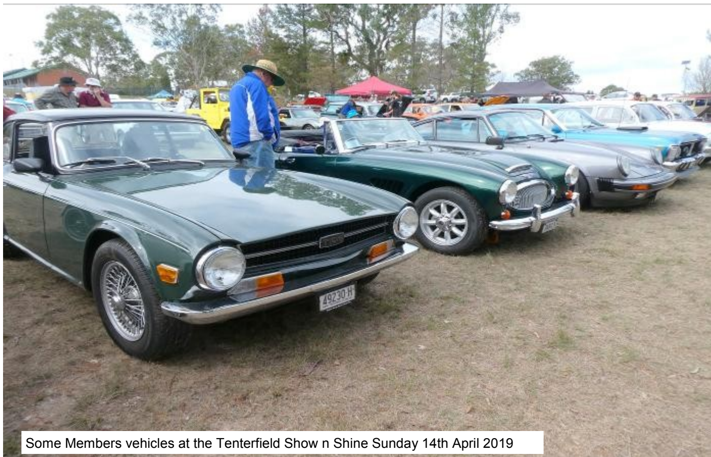
Some Members vehicles at the Tenterfield Show n Shine Sunday 14th April 2019

NEWSLETTER OF SUMMERLAND SPORTS & CLASSIC CAR CLUB INC.