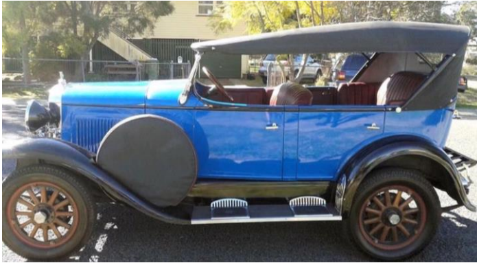
Representation of Alan’s Whippet

It had a flathead 4-cylinder motor with 3-speed gearbox, band breaks on the rear and drum brakes on the front. It was a 4-seater sedan with a soft top and had headlights, horn, etc. There was a fuel gauge in the rear tank.