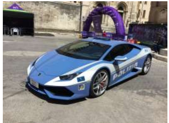
Bruce Cameron in hot pursuit at the Giro Italia