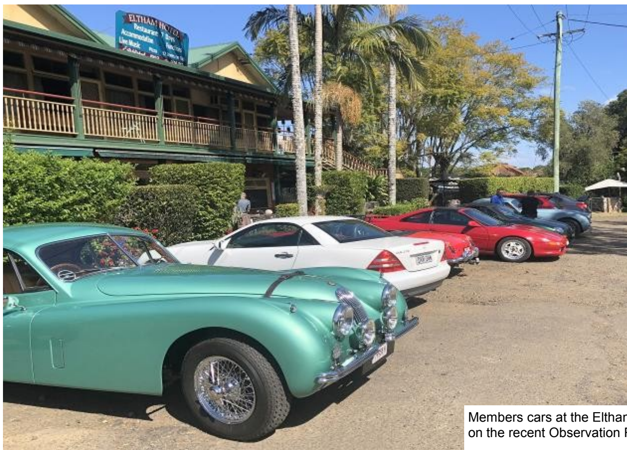
Members cars at the Eltham Hotel on the recent Observation Run

NEWSLETTER OF SUMMERLAND SPORTS & CLASSIC CAR CLUB INC.