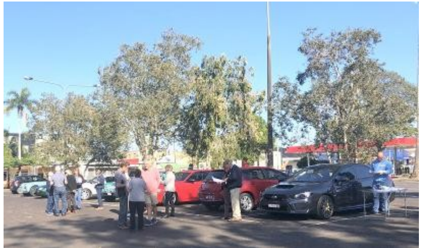
Very handy portable table Bryan!