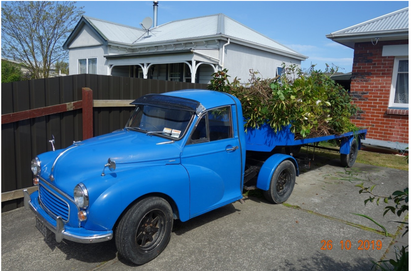
A unique Morris Minor spotted in New Zealand last month

From December through to February 2020, we still have a few events that are being organised by Volunteer Needed. If you would like to get involved organising one of these events you will get help to do so and you will lighten the load on poor old Volunteer Needed.