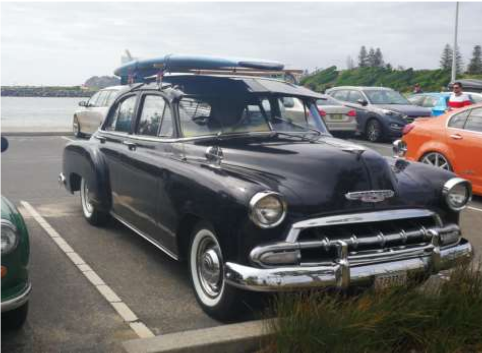
Chev at Tuncurry car park. (I wonder if the surfboard ever comes off)

Back in February, the Taree Motorcycle Club held a rally at Halidays Point , just north of Forster. The rally was based at the Halidays Point Caravan Park. All this seems light years away now. For those who are not familiar with motorcycle rallies the format is roughly this. There is a short ride on the Friday with a sausage sizzle that night. Saturday brings the main ride, starting around 9.30am with a catered lunch stop and a return by about 3.00pm. This ride can be up to 300km. There is a dinner and presentation at night and usually raffles. The dinner is all over by about 9.30pm. Sunday brings a short ride starting about 9.30am arriving back about 11.30am to allow people to pack up and early BBQ lunch. Most head home between 12 and 1.00pm. This year there were about 100 classic bikes and we had perfect