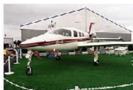
Cirrus VK-30 kit aircraft

In June 2004, Cirrus received type certification for the SR20 from the European Aviation Safety Agency (EASA) That same year,