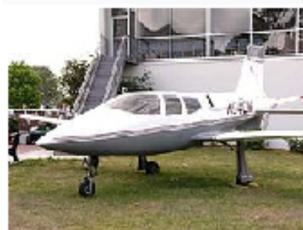
Cirrus-designed IsrAviation ST50 at the Paris Air Show in 1997