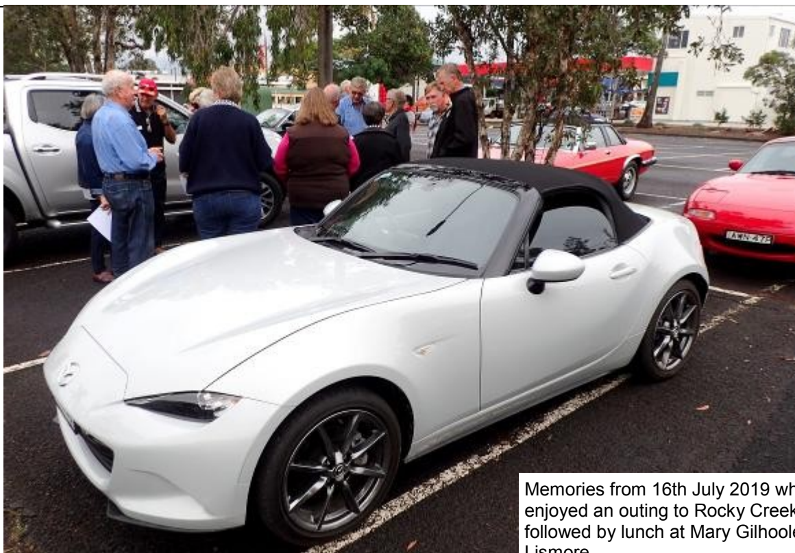
Memories from 16th July 2019 when we enjoyed an outing to Rocky Creek Dam, followed by lunch at Mary Gilhooleys pub in Lismore

NB MEETING WILL BE HELD ON 1st JULY 2020 at 7.00PM