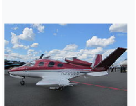
Cirrus Vision SF50 single engine very light jet