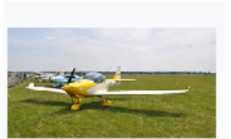
Cirrus SRS light-sport aircraft (Fk14 Polaris)

The series incorporates other unusual design elements. All SR-aircraft use a mechanical side yoke instead of the traditional yoke or stick flight controls. The aircraft also use a single power lever that adjusts both throttle and propeller RPM via a mechanical cam actuated throttle and propeller control system. Construction is dominated by composite materials (a technique the company has used with every model since its first design in 1988, the VK-30), although traditional aluminum is used for flight control surfaces.