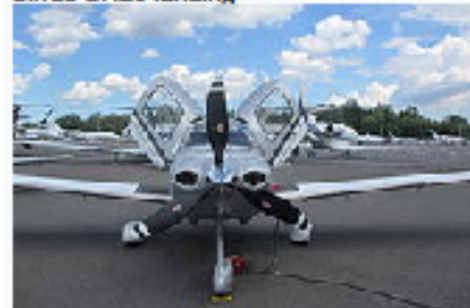
Cirrus SR22 front view