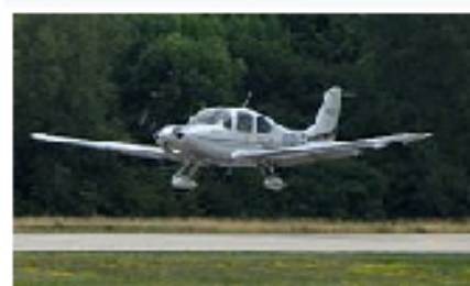
Cirrus SR20 landing