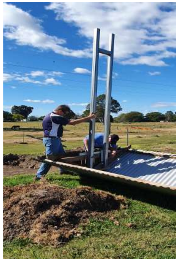
I think we might need a bigger tow truck